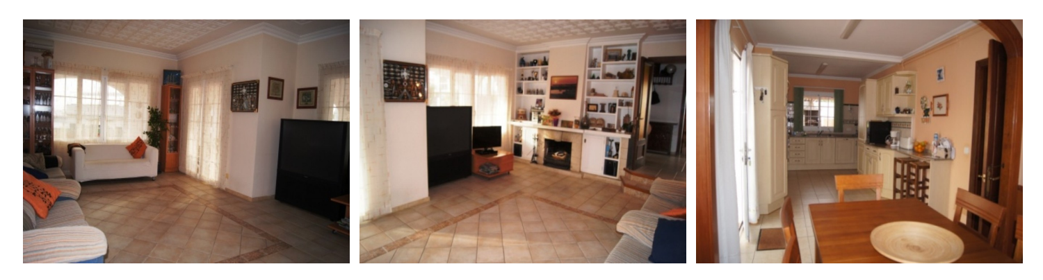
Important Notice: These details have been produced in good faith and are believed to be accurate based upon the information supplied but they are not intended to form part of a contract. You are strongly advised to check the availability of the property before travelling any distance to view. Any intending purchasers must satisfy themselves by inspection or otherwise as to the correctness of each of the statements contained in these particulars.

A contemporary styled, large family villa situated in a quiet cul-de-sac in the popular village of Son Vilar, just a few minutes from Es Castell town centre. The villa comprises 5 double bedrooms, 3 bathrooms, large lounge with chimney, air-con and central heating, fully fitted and equipped kitchen with a large dining area, pantry and laundry room. Outside there are lots of covered terraces, open terrace and swimming pool. other features include a double garage, large driveway for cars/boat, storeroom and workshop. The property is low maintenance and includes double glazing, air conditioning hot/cold air and central heating. All broadband systems are available. Just a few mintes drive (or 10 minute stroll) into the 2 large towns of Es Castell and the Capital, Mahon, the Port of Mahon and the Cosmopolitan bay of Cala Fonts.