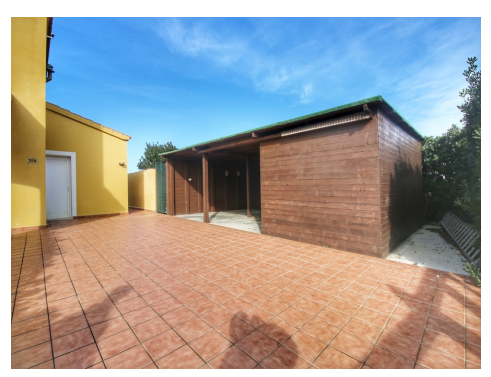
Important Notice: These details have been produced in good faith and are believed to be accurate based upon the information supplied but they are not intended to form part of a contract. You are strongly advised to check the availability of the property before travelling any distance to view. Any intending purchasers must satisfy themselves by inspection or otherwise as to the correctness of each of the statements contained in these particulars.